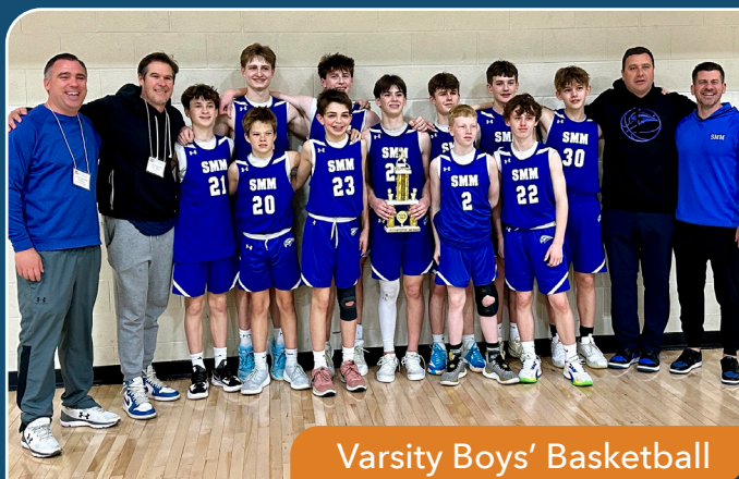
Varsity Boys' Basketball