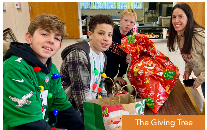
The Giving Tree