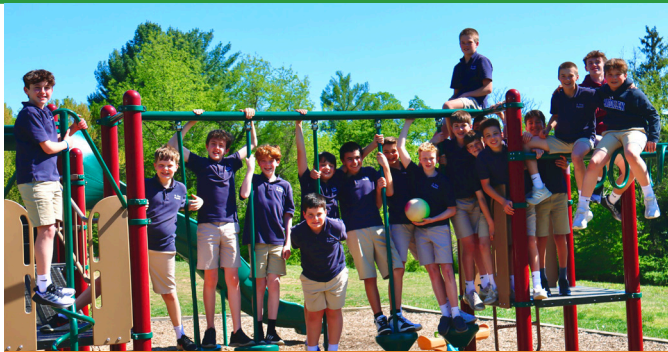
The God Squad