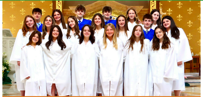
The Class of 2025