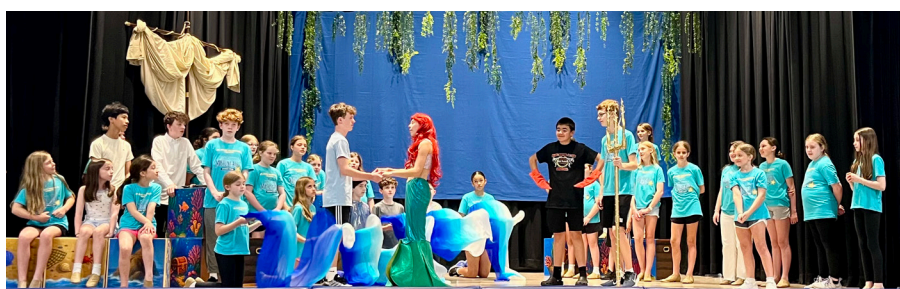
The Theater Club's The Little Mermaid in Rehearsal

Dive Under the Sea with SMM Theater! For ticket inquiries, please contact Meggie or Katie at theater@stmarymagdalen.net .