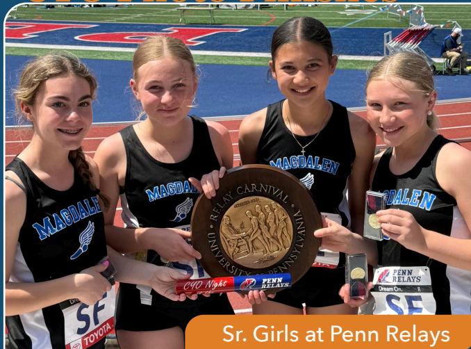
Sr. Girls at Penn Relays