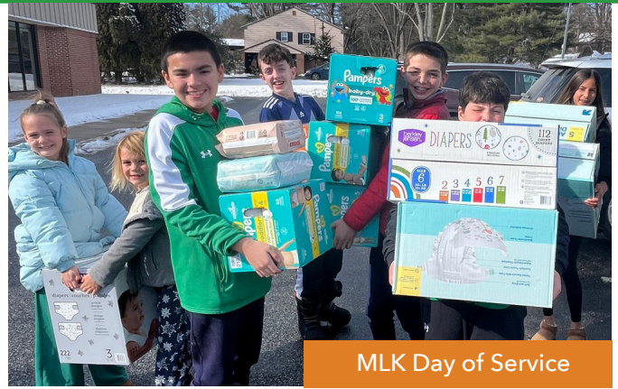
MLK Day of Service